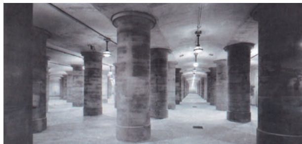
The passageways of the "Souterraine", 27 metres below ground

Quantity of gold sufficient to form a wire 2,500 m in length and cover a surface area of two square metres